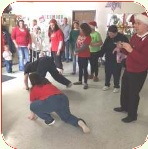
Let the DANCE PARTY begin!!!