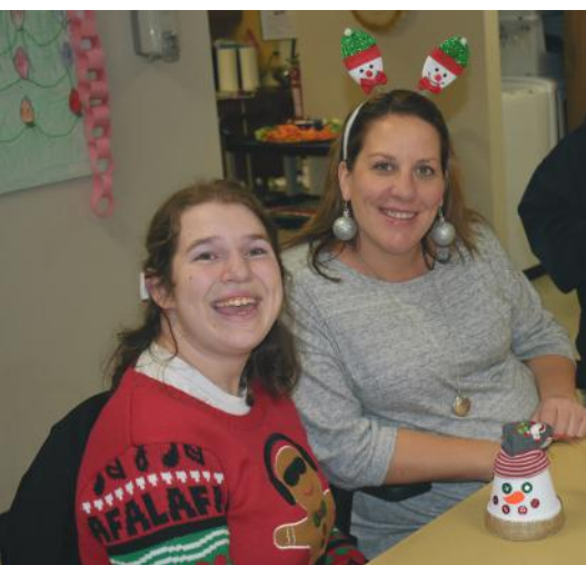
2018 was one of the best parties to date!