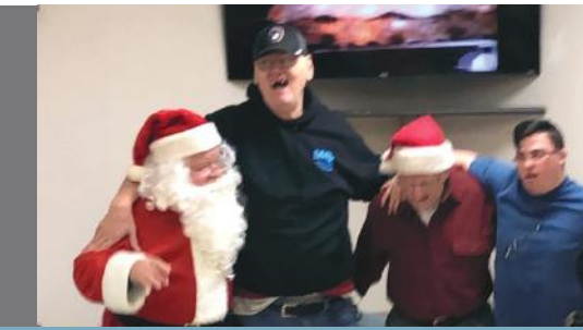
Oh, what fun and memories we shared!!!