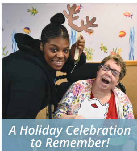
A Holiday Celebration to Remember!