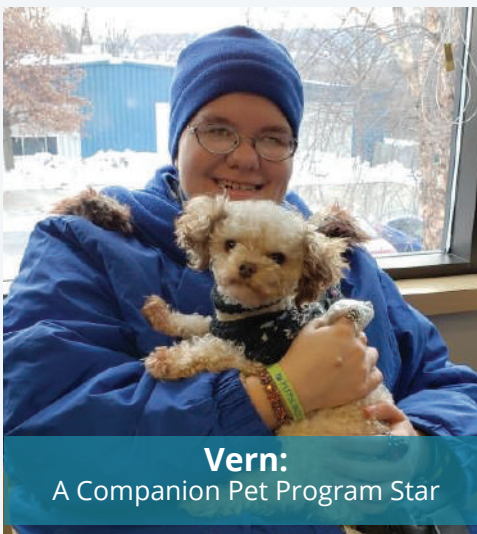
Vern: A Companion Pet Program Star