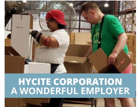
HYCITE CORPORATION A WONDERFUL EMPLOYER